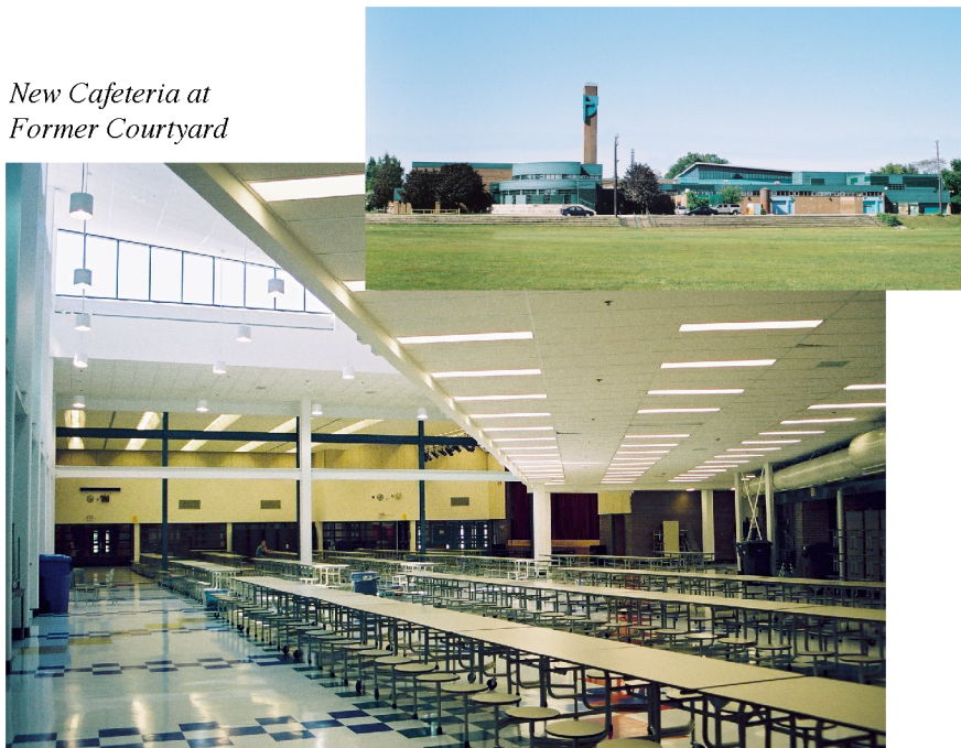
New Cafeteria at Former Courtyard